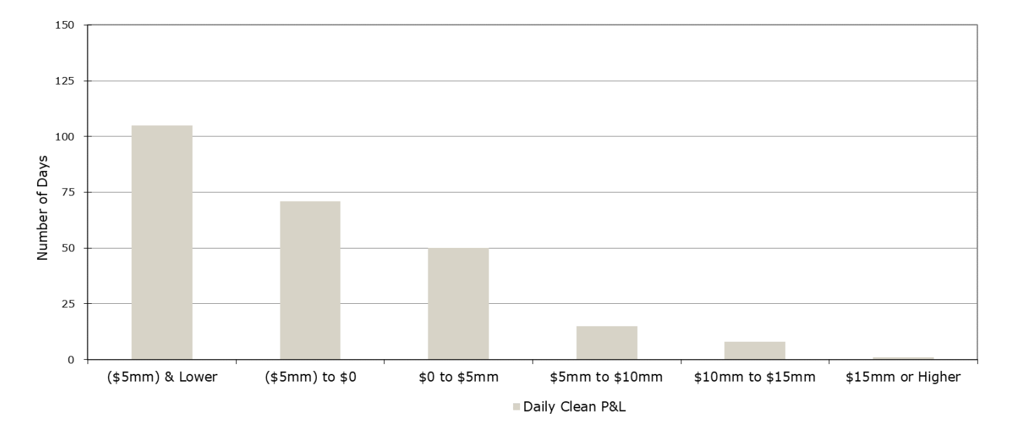
Table 24: Distribution of Daily Clean P&L - 12 Months Ended September 30, 2022

Table 24 provides information on the distribution of daily trading-related revenues for the Company's covered positions. This trading-related revenue is the clean P&L of the Company's covered trading positions that would have occurred had previous end-of-day covered trading positions remained unchanged, as defined above.