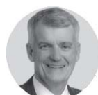
Timothy J. Sloan

CEO and President, Wells Fargo & Company